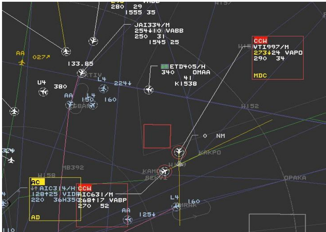
System showing Current conflict warning (CCW)

yellow is a safety feature of the Automation System. This indication was neglected by the Radar Controller. As per the controller's statement, this feature was not taught to him or he doesn't remember. Later CCW alert came on Radar.