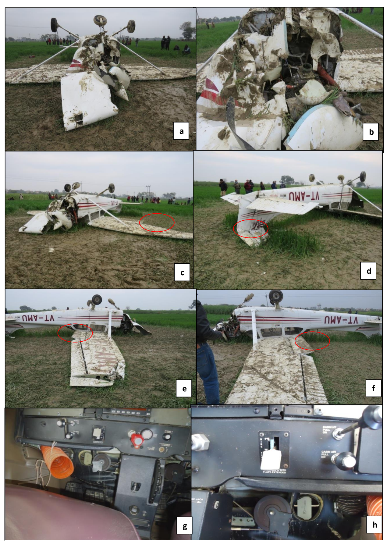
Figure 2 (left to right): a-Damaged Aircraft upside Down; b-Damaged Nose Portion; c-Bent Starboard wing; d-Bent Ventral Fin due to weight; e-Aircraft Left Flap extended position; f-Aircraft Right Flap extended position g-Flap Selector Switch in 100 Position; h-Throttle in Full Power Position