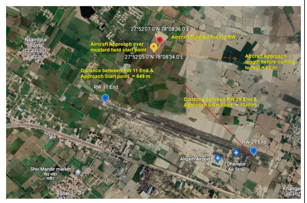
Figure 3: Aircraft Crash Site with distances marked

At the crash site it was observed that the aircraft created an inclined furrow over the mustard