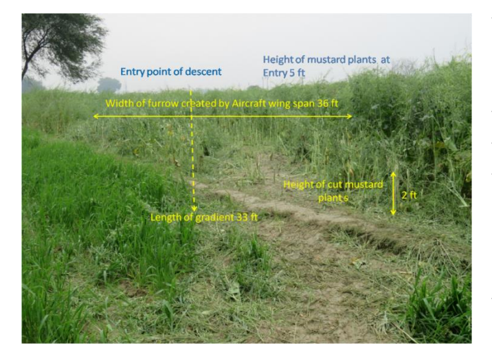
Figure 4: Aircraft Crash Site with distances marked

field, chopping of the plants with a gradient in a gradual manner. The width of the furrow created by the aircraft was 36 ft. which is akin to the wing span of the aircraft. The height of the mustard plants at the entry point of the field was 05 ft. approximately and the minimum height of the plants cut by the aircraft was 02 ft. The main wheels and the engine propeller created tracks on the field up to a distance of 160 feet. The tell-tale signs of chopping of the mustard plants of 05 ft. height to 02 ft. height over a distance of 33 ft. created by the aircraft indicates that the aircraft had